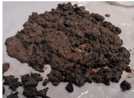
Samples of wellbore debris removed from the well by the PrecisionCollector 250

Altus provided good and efficient service in quickly mobilizing the PrecisionCollector system after we lost injectivity during stimulation. The system performed as promised, not only in this well but in similar situations on previous wells.